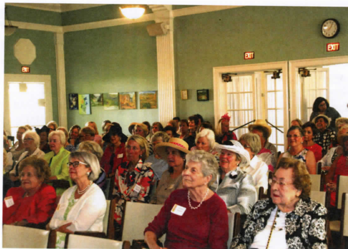
Meetings are held weekly and include two guest speakers and an optional catered lunch

Ultimately, these new gardens were built to become an asset to the neighborhood and a place of meditation and meeting for the club's members and friends. ❖