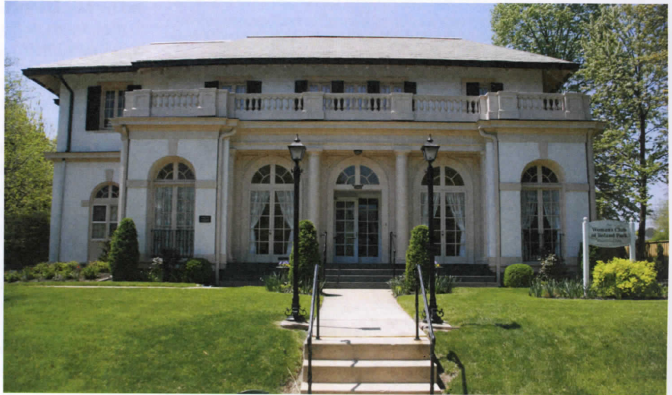
Photo of the front of the clubhouse

Both the Club and clubhouse have grown and adapted over the years to accommodate the changing needs of our members and society. Meetings are now weekly