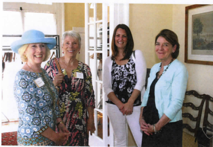
Meetings are both educational and social

As our 2018-2019 fiscal year begins this June, a membership campaign is now underway. Initially, only residents of Roland Park were eligible, but we have since expanded to include women throughout the entire Baltimore area. Membership is by invitation, which means two existing members must sponsor each application.